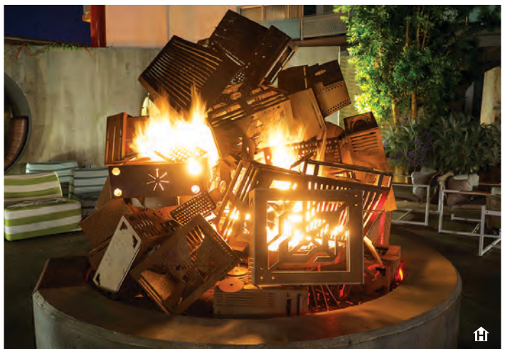
PHOTO: ©2016 LINA DUONG, JETT LANDSCAPE ARCHITECT + DESIGN. KIMBERLY SIKORA PHOTOGRAPHER. WWW.KIMBERLYSIKORA.COM .

A “pyrotechnic sculpture” – a fire pit made from flaming computer monitors and discarded electronics – adds to the fantasy. In a nod to the old salts of the wharf, portholes, harpoons, rugged coastal plants, and gabion walls filled with recycled aluminum cans, abalone shells and cobblestones, add to the madcap wonderland.