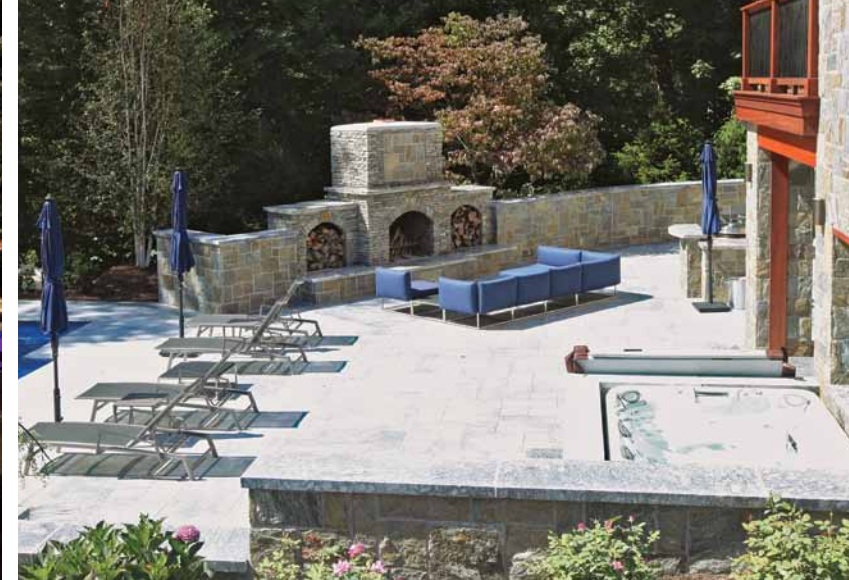
This sprawling outdoor oasis perfectly demonstrates Preferred Properties expertise at designing functional multilevel outdoor kitchen, living, pool and great room spaces.