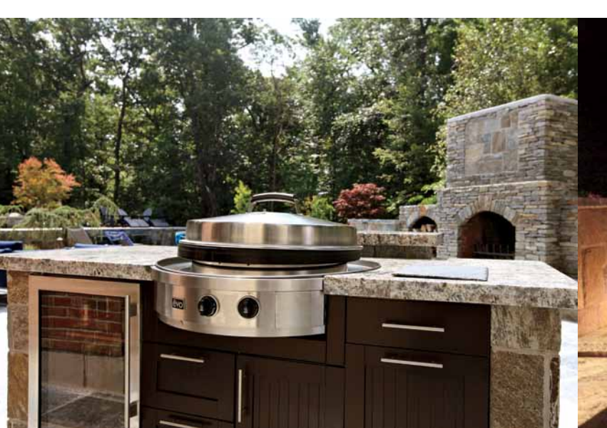
Cooking outdoors isn't just about grilling. Look no further than this high-end hibachi, one of many items available on our website, where great outdoor kitchen ideas begin.