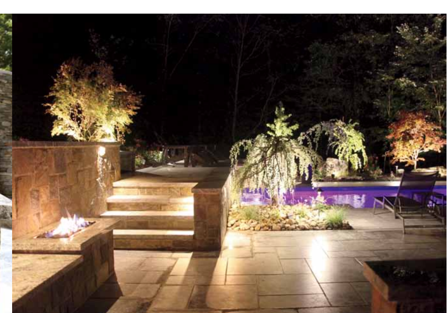
Gotowala's award-winning talent as an outdoor lighting designer brings landscapes and hardscapes out of the dark with innovative, artistic and visually striking treatments.